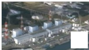
WATCH: Cooling Mission Resumes on Japan Plant