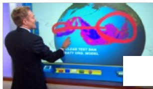
WATCH: Mapping Japan's Radiation Zone