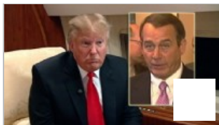
WATCH: Trump on Boehner's Crying: 'I Don't Like It'